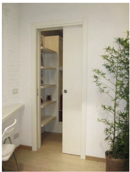
Thanks to its practical snap-together system, EvoKit is quick and easy to assemble and creates space in a stylish way.