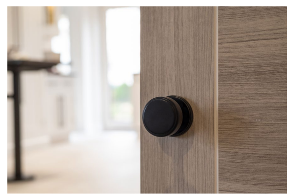
Atmospheric Urban Dark Bronze enhances the industrial design of this knob.