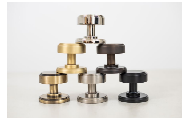
The Boulton design in Antique Brass is a perfect pairing.