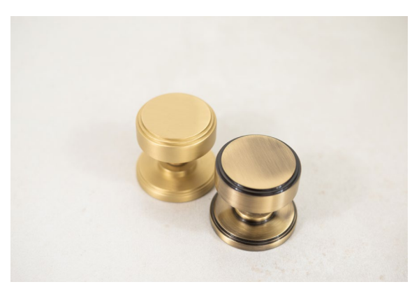
A clean, graceful design. Modern, detailed, yet elegant.