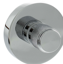
Finish Photographed: Polished Chrome (PC)