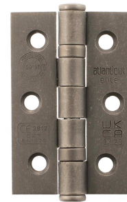
Product Finish Pictured: Distressed Silver (DS)