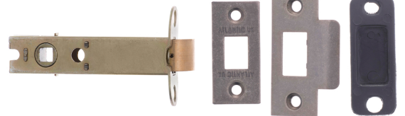
Product Finish Pictured: Distressed Silver (DS)