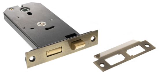
Product Finish Pictured: Antique Brass (AB)