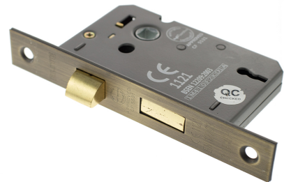
Product Finish Pictured: Matt Antique Brass (MAB)