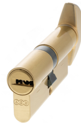
Product Finish Pictured: Satin Brass