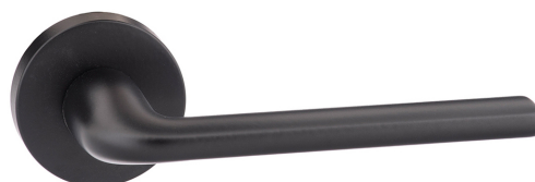
Finish Photographed: Matt Black (MB)