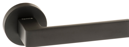
Finish Photographed: Matt Black (MB)