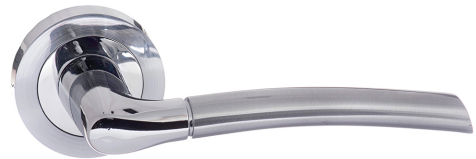
Product Finish Pictured: Satin Chrome / Polished Chrome