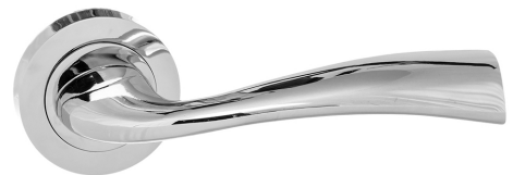
Product Finish Pictured: Polished Chrome