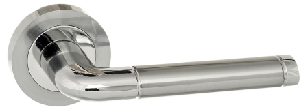
Product Finish Pictured: Satin Chrome/Polished Chrome