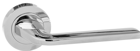
Product Finish Pictured: Polished Chrome