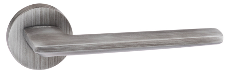
Finish Photographed: Urban Graphite