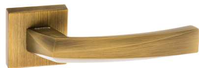
Finish Photographed: Yester Bronze