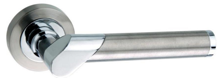
Product Finish Pictured: Satin Nickel / Polished Chrome