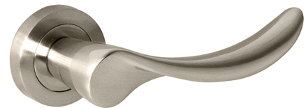
Product Finish Pictured: Satin Nickel