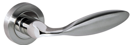
Product Finish Pictured: Satin Nickel / Polished Nickel