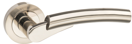
Product Finish Pictured: Satin Nickel / Polished Nickel