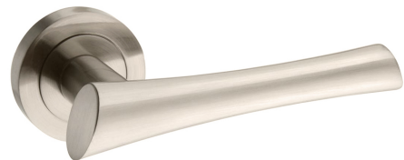
Product Finish Pictured: Satin Nickel