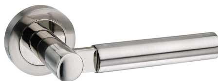
Product Finish Pictured: Satin Nickel / Polished Nickel