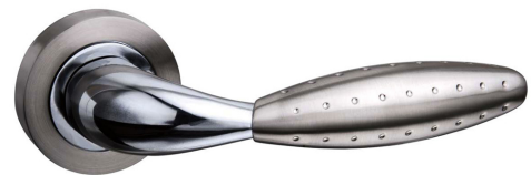
Product Finish Pictured: Satin Nickel / Polished Chrome