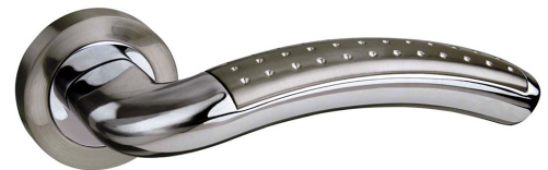
Product Finish Pictured: Satin Nickel / Polished Chrome