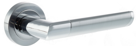
Product Finish Pictured: Satin Chrome/Polished Chrome