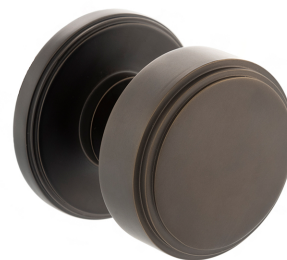
Finish Photographed: Urban Dark Bronze