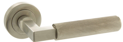
Finish Photographed: Satin Nickel