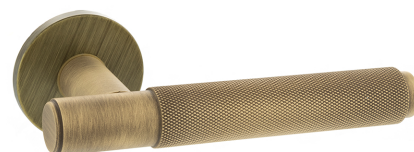
Finish Photographed: Yester Bronze (YB)