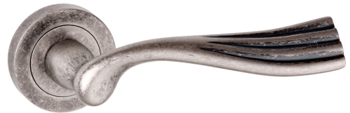
Product Finish Pictured: Distressed Silver