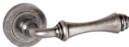
Product Finish Pictured: Distressed Silver