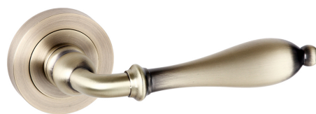
Product Finish Pictured: Matt Antique Brass