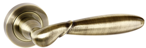
Product Finish Pictured: Antique Brass