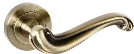
Product Finish Pictured: Antique Brass