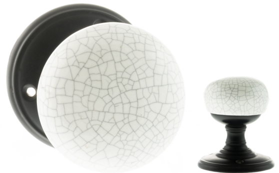
Product Finish Pictured: MATT BLACK