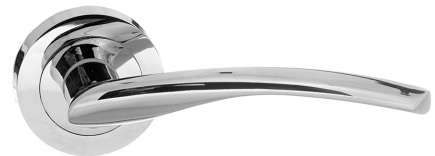
Product Finish Pictured: Polished Chrome