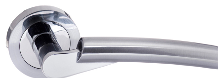
Product Finish Pictured: Satin Chrome / Polished Chrome