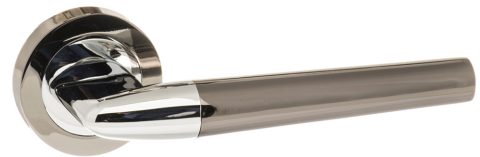
Product Finish Pictured: Black Nickel/Polished Chrome