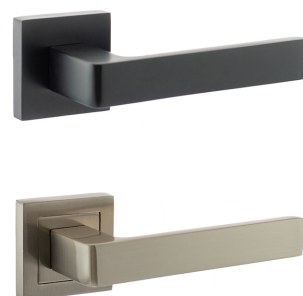
Product Finish Pictured: Matt Black & Satin Nickel