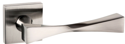
Product Finish Pictured: Satin Nickel