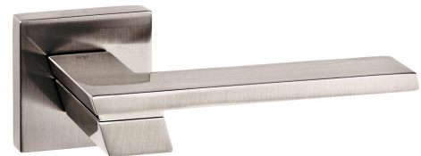
Product Finish Pictured: Satin Nickel