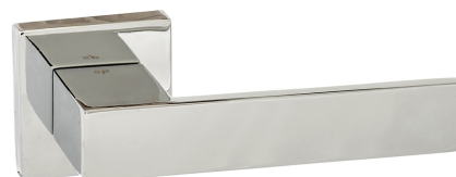
Product Finish Pictured: Polished Chrome