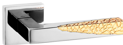
Product Finish Pictured: Polished Nickel Gold Plate