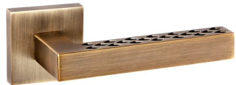
Product Finish Pictured: Weathered Antique Bronze