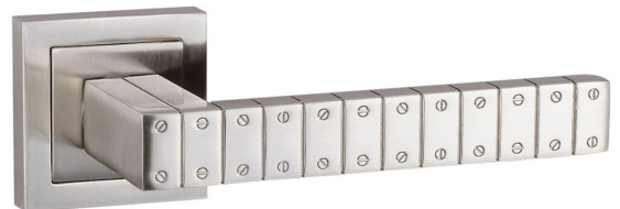
Product Finish Pictured: Satin Nickel