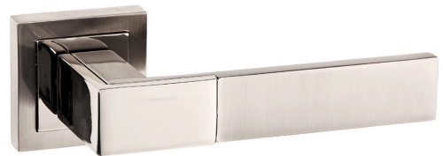
Product Finish Pictured: Satin Nickel Polished Nickel