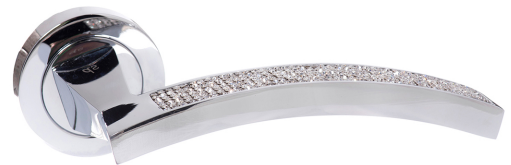
Product Finish Pictured: Crystal Polished Chrome