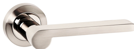
Product Finish Pictured: Satin Nickel Polished Nickel