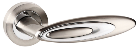
Product Finish Pictured: Satin Nickel Polished Chrome