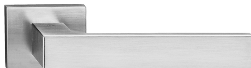
Finish Photographed: Satin Chrome (SC)