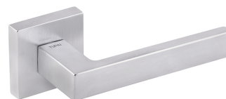
Finish Photographed: Satin Chrome (SC)